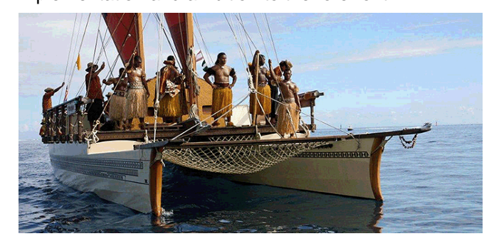
Traditional Fijian voyaging Canoe, IUCN 2014.

COP23 concluded with the adoption of a decision package, dubbed the <u>'Fiji Momentum for Implementation'</u> (CP/1.23). The decision reemphasizes Parties' determination to conclude the Paris Rulebook by December 2018 and recognizes that an additional negotiation session may become necessary during the latter half of 2018. Furthermore, the decision officially launches the Talanoa Dialogue and brings pre-2020 implementation and ambition to the forefront.